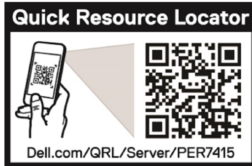
Figure 2. Quick Resource Locator for PowerEdge R7415